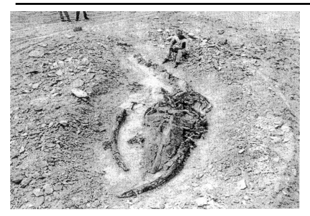
Figure 5. Whale WCBa-248, showing skull, lower jaws, articulated vertebrae, ribs and limb bones. The skull rested above several vertebrae and ribs, which indicates that it moved back from its original position before burial.

whale are within the same horizon. Small scour-and-fill structures parallel to the vertebrae occur in the sediment associated with some skeletons. No other sedimentary structures were found in the sediment associated with the skeletons. Sediment very close to the bones is sometimes orange-brown, probably due to the staining caused by soft tissue decomposition. In some whales specific tissues, like intervertebral disks or spinal cord, have been replaced by hard, black mineral (yet to be identified). A number of whales (n=5) have the baleen preserved (fig 4). In four of them, the baleen is mineralized and preserved in life position within the mouth. In another individual a section of baleen drifted out of the mouth and lies above one of the limbs. The occurrence of baleen has important preservational and paleoenvironmental implications. Since the baleen is an organic structure made of keratin and decays rapidly, its preservation requires a high rate of deposition for the diatomite in which it is buried.