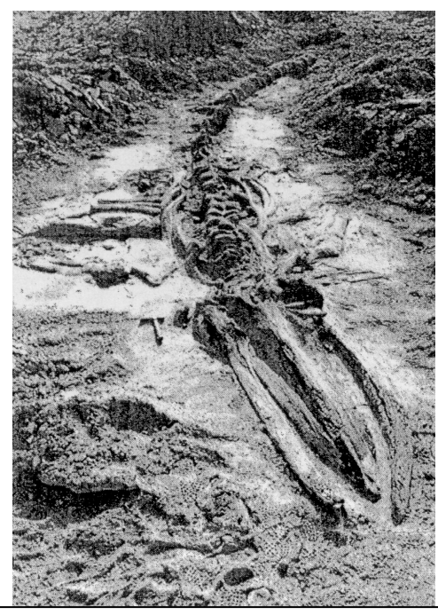
Figure 3. Whale WCBa-20. This specimen is fully articulated and well preserved. The two flippers are preserved. Seven shark teeth were found associated with the bones, although no shark tooth marks were found on the bones.